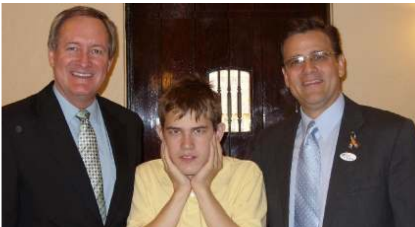
Sen. Crapo, left, with CT CEO Oberleitner and son Robby

Of the products' applications, several military ones were particularly relevant for Senator Crapo, who is a strong proponent of telemedicine in the Senate; in addition to the unmet needs of U.S. military service-members' special-needs children, two especially pressing conditions that Sen. Crapo felt that CT's technology could address are Traumatic Brain Injury (TBI) and Post-Traumatic Stress Disorder (PTSD).