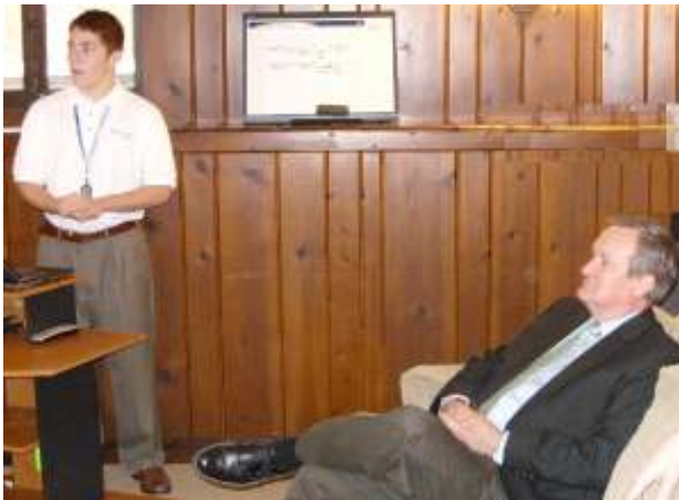
Sen. Crapo is briefed on Behavior Imaging™

Mike Crapo, United States Senator from Idaho, visited Caring Technologies' headquarters on Tuesday, November 4 th . He received a tour of the company's offices, a briefing on CT's focus, and a comprehensive demonstration of the latest Behavior Imaging technology. He understood the need for B.I. Capture and B.I. CARE and affirmed his strong support for Caring Technologies' mission.